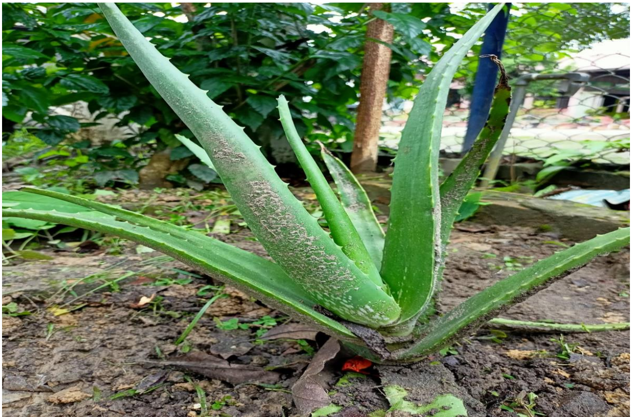
PIC 3: Aloe sp. of the mini succulent garden

An initiative was taken by ECO CLUB on 4 th of December, 2021, along with the Botanical Society of J.B. College to set up a small garden of succulents in the Botanical garden of the college. Succulents are a group of plants which are found in xerophytic conditions and are known to store water in its body. Also contemporary research indicates that succulents are highly efficient at scrubbing carbon-di-oxide from the atmosphere and unlike most plants, they do not release carbon-di-oxide at night. Instead they continue to produce oxygen. This continuous burst of oxygen refreshes air content in our house and improves breathing as well.