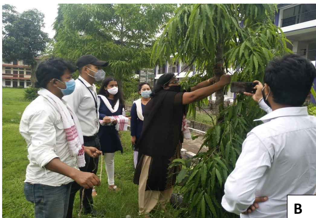
PIC 6 (A,B):World Environment Day, 2021, Orchid plantation on the college campus