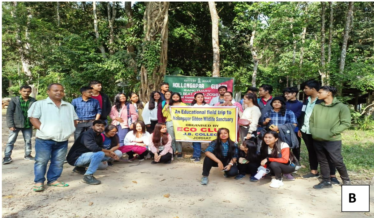
PIC 5(A,B):A trip to Hollongapara Gibbon Wildlife Sanctuary conducted on November 21st, 2021