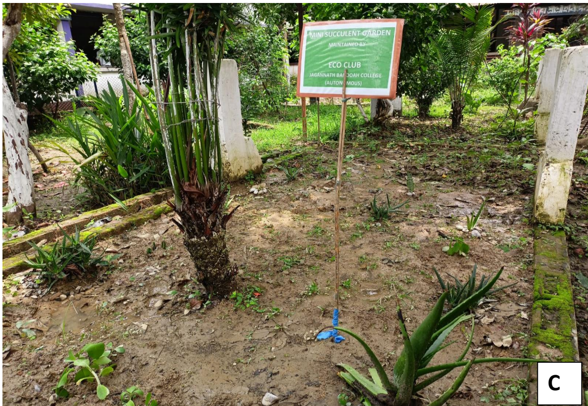
PIC 4(A-C): Some succulents in the mini garden maintained by ECO CLUB, J.B. College (Autonomous)