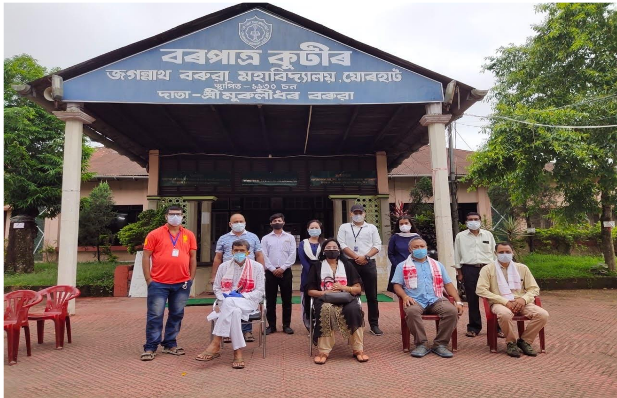
PIC 7: World Environment Day, 2021: Orchid plantation on the college campus