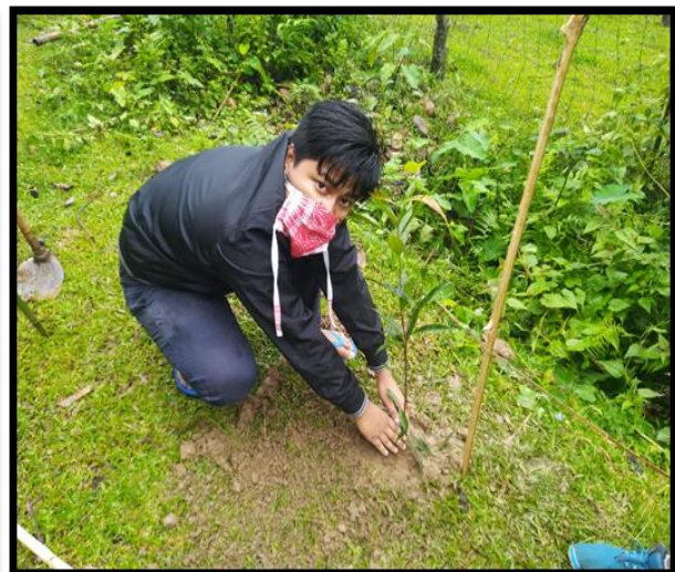
PIC 8: Plantation of saplings in the homestead gardens