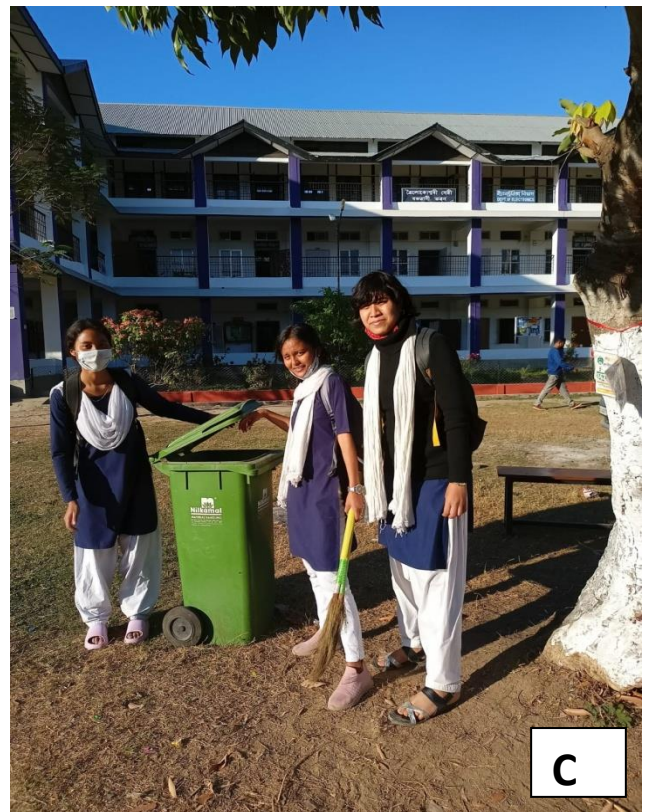
PIC 2 (A-C): Cleanliness drive in J.B. College (Autonomous) campus December, 2021