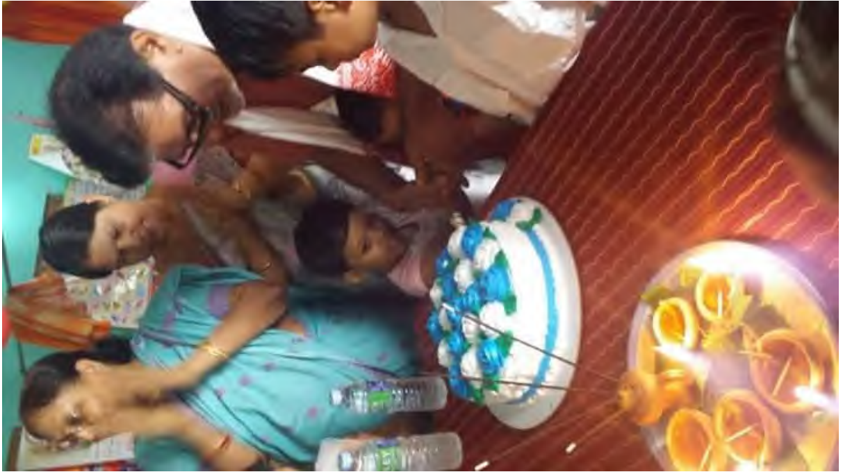
Formal Cake cutting.