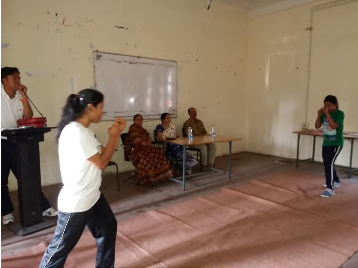
GIRLS IN ACTION