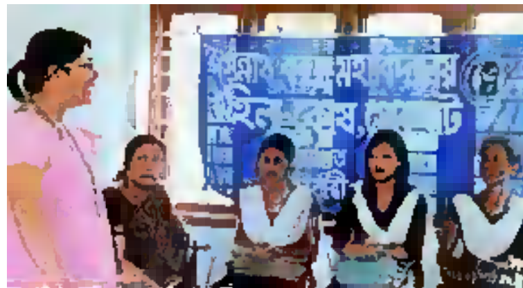
Awareness programme on Prevention of Sexual Harassment