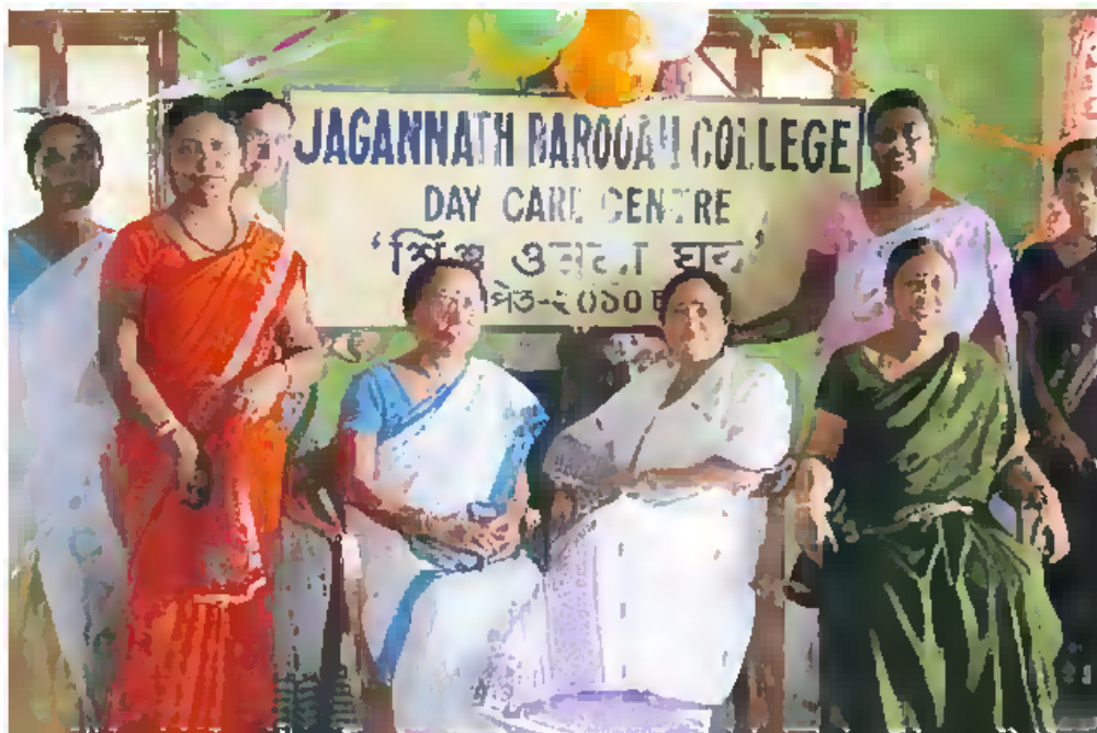
A moment in the Day Care Centre