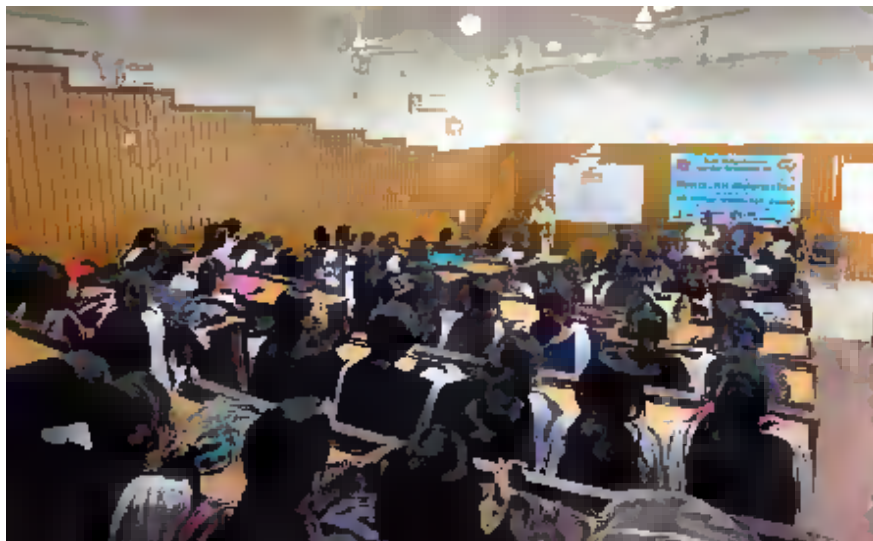
Talk programme : Invited speaker Prof. Shakuntala Devi