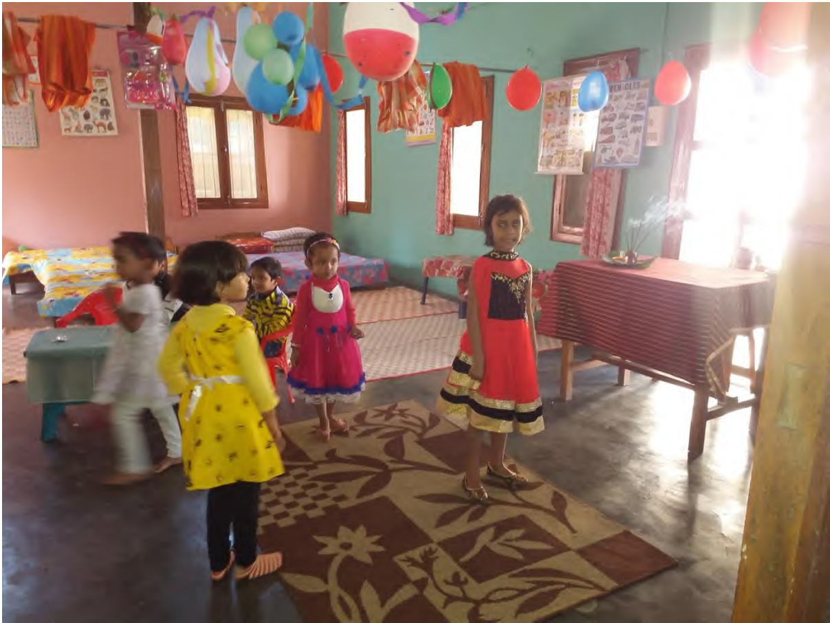
Children at Creche