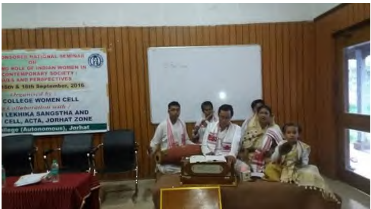
The Cultural show at the Valedictory session.