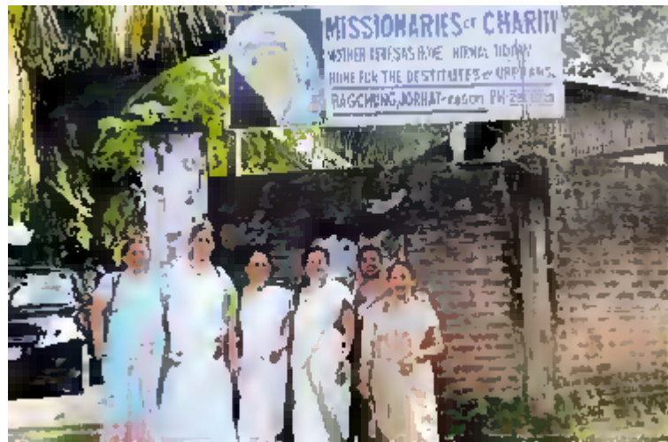
Visit to Nirmal Hriday