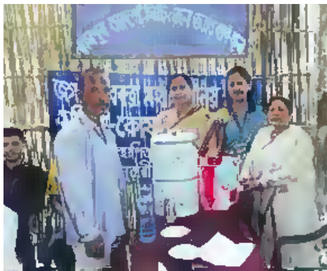
Programme at Rampur Bhakat Mising Gaon