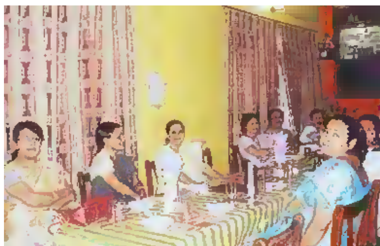
Fellowship moment ...