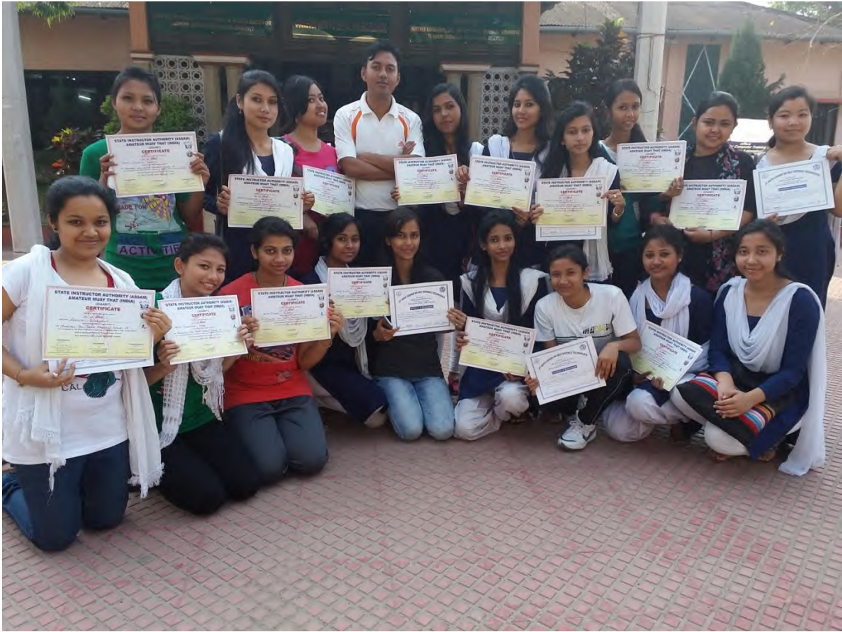
Girls with Certificate after successfully completing the course.