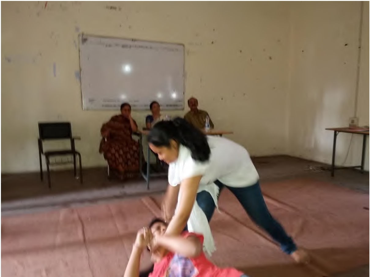
Girls in action.