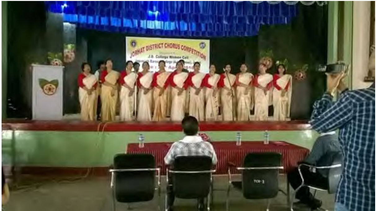
JB College WOMEN CELL MEMBERS SINGING THE WELCOME SONG.