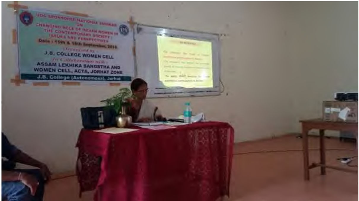
A Technical Session in Progress.