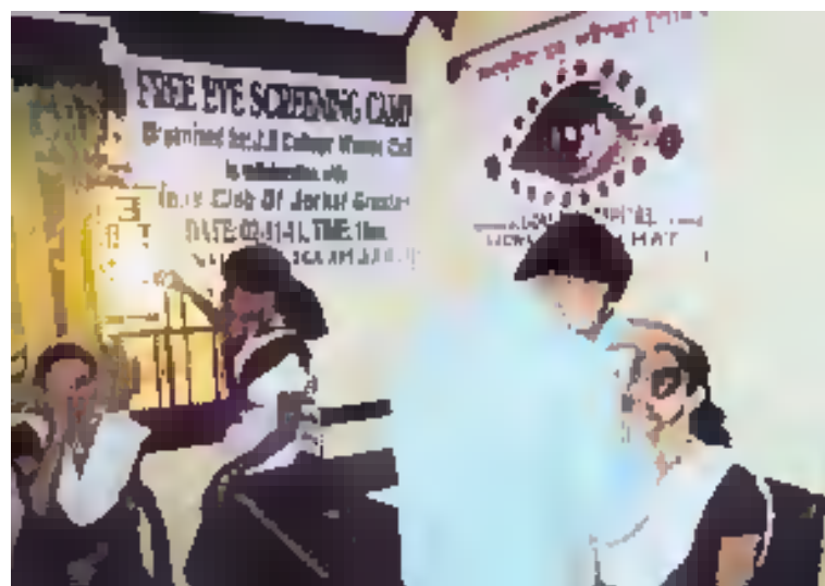
Eye screening camp