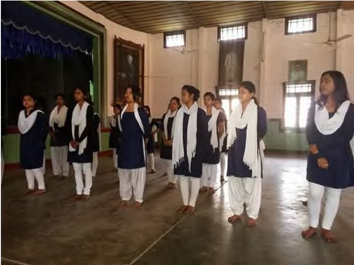
Girls participating in Physical fitness workshop.

2.UGC SPONSORED National Seminar on Changing role of Indian women in the contemporary society : Issues and Practices organised by WOMEN CELL IN COLLABORATION WITH Assam lekhika Songstah and Women cell, Assam College Teachers UNIT , Jorhat ZONE on 15 th and 16 th september