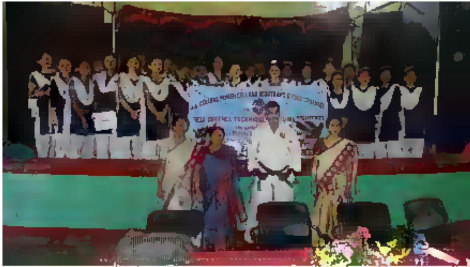
Workshop : Self Defence Technique for the Girl Child