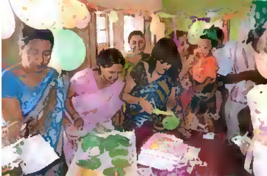
Observation of Childrens Day at Day Care Centre