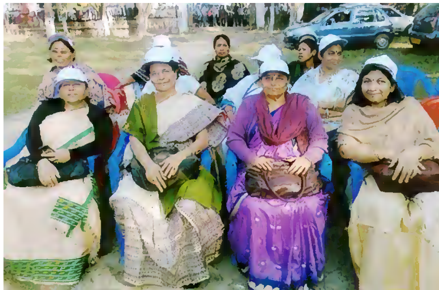
Awareness Camp on 'Violence against Women'