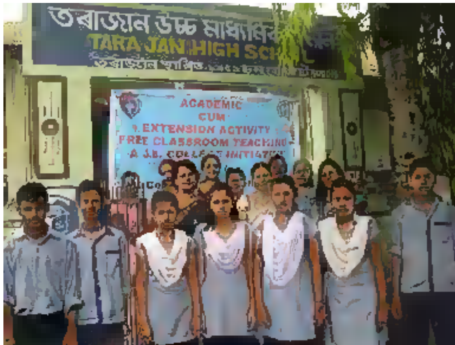
Reaching out to the Community Classroom teaching programme