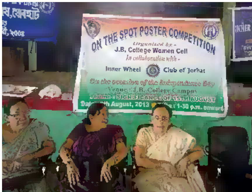
On the Spot Poster Competition on the occasion of Independence Day