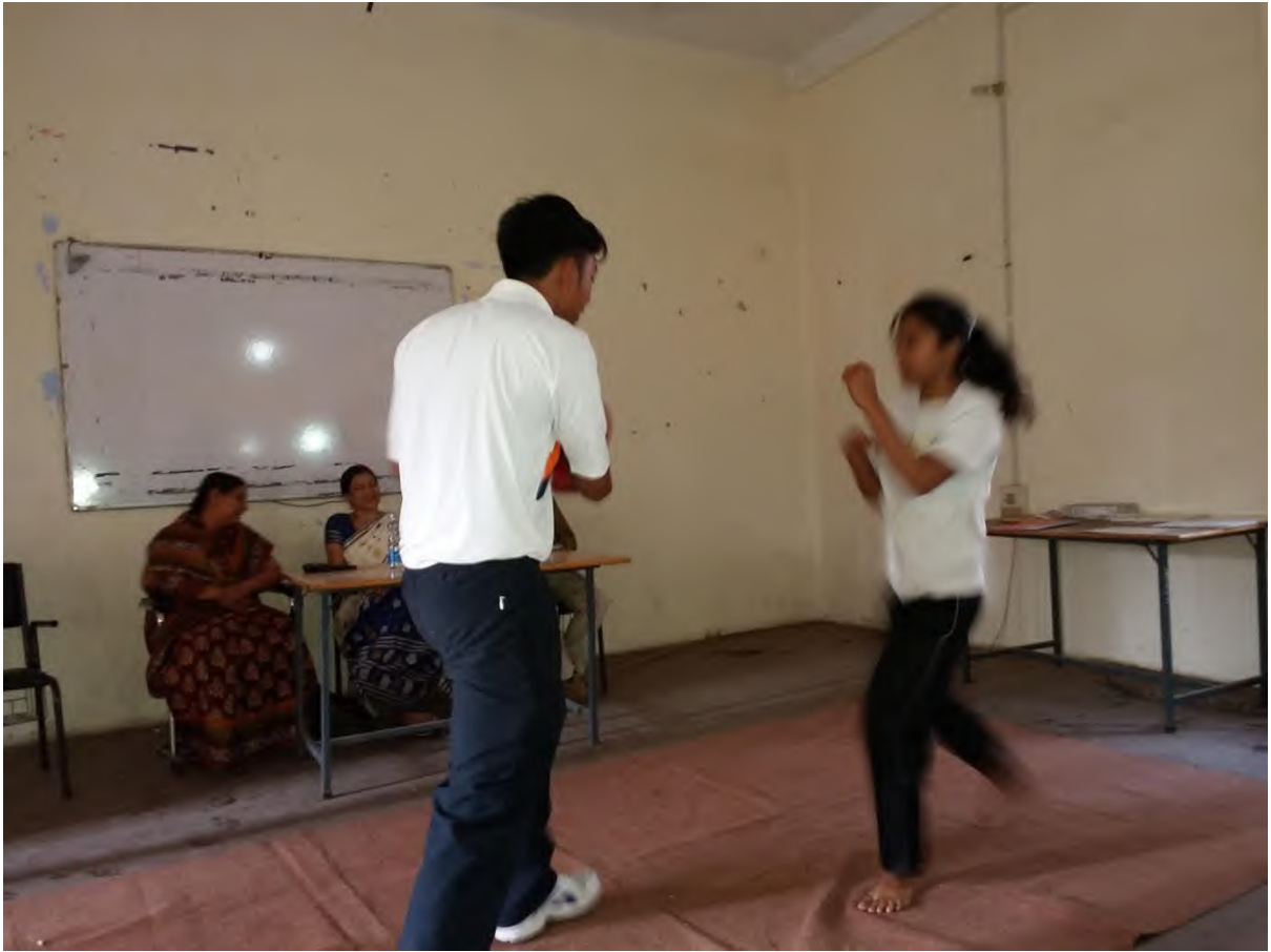
Girls i practice.